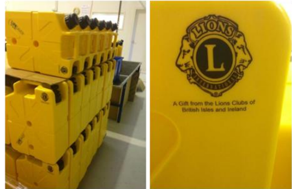
What your money is paying for

Within days of the disaster clubs in the district were mobilising themselves to organise events and collections.