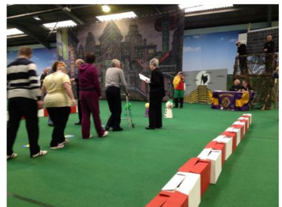
One of the games in full swing