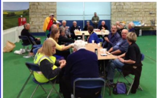
A well-deserved break for lunch