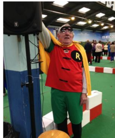
Malvern's own Superhero