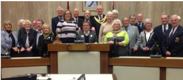
In the hot-seat