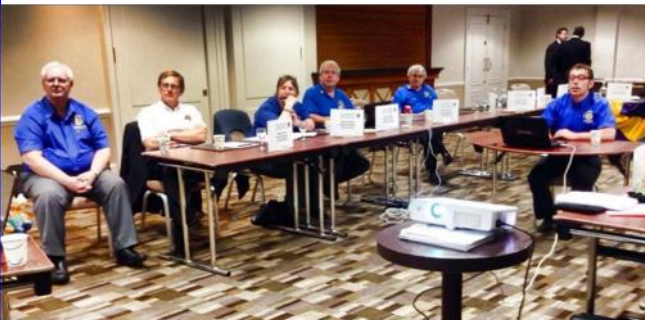
Running a training session at Council

All of these showed that we can use technology to make meetings more efficient throughout the MD and in the districts. As far as this weekend was concerned we shortened the business sessions allowing time for training sessions on Skype and using Survey Monkey.